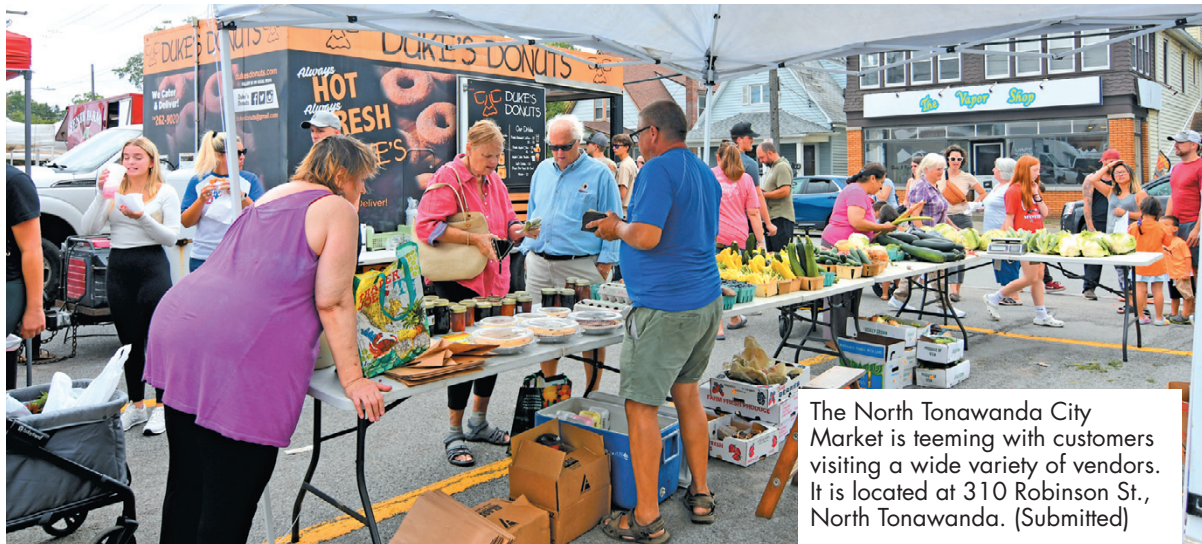
The North Tonawanda City Market is teeming with customers visiting a wide variety of vendors. It is located at 310 Robinson St., North Tonawanda.

Final Day of the season at The V Randa is this Sunday, October 1st. Watch Buffalo squish the fish at The V this Sunday.